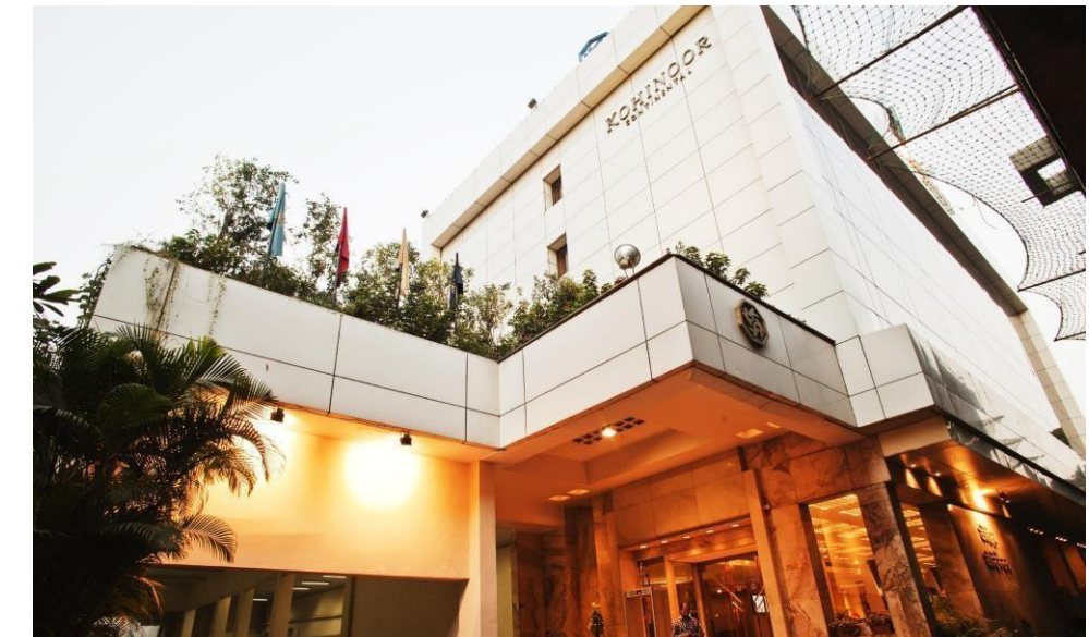
HOTEL KOHINOOR CONTINENTAL

Theme: Critical Care Nursing: “Leading Transition and Transformation”